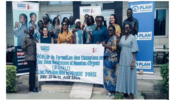
Group picture of sexual reproductive healthcare professionals who were part of the Training of Trainers

dynamic perspective into the training making the learning experience not only more relevant but also more engaging and impactful.